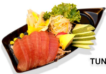
250 TUNA SASHIMI