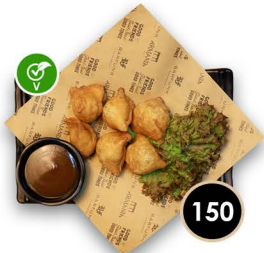
150 Potato Samosa