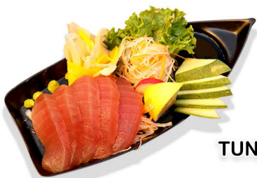
250 TUNA SASHIMI