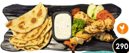
290 Chicken Kebab