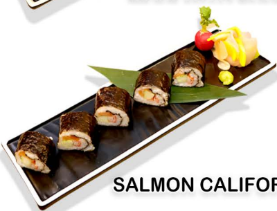
199 SALMON CALIFORNIA ROLL