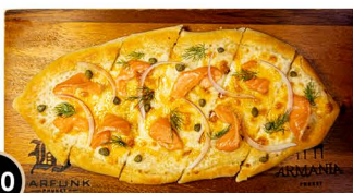
Salmon Pizza Bianca