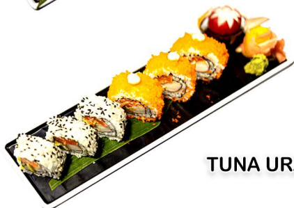
199 TUNA URAMAKI