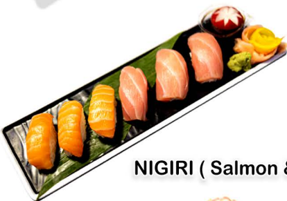
199 NIGIRI ( Salmon & Tuna)