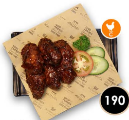
190 Chicken Wings BARBEQUE | SPICY