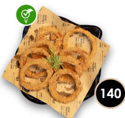
140 Onion Rings