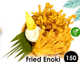
150 Fried Enoki Mushroom