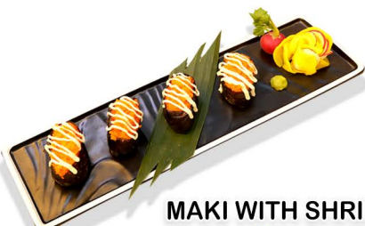
199 MAKI WITH SHRIMP EGG