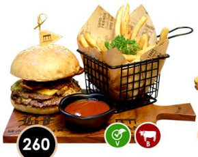
Beef Burger with Bacon