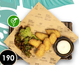
190 Mini Cheddar Cheese Jalapeno