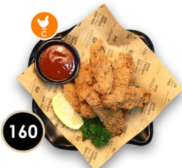
160 Chicken Fillet