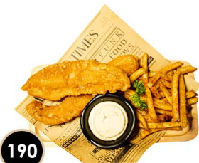
190 Fish & Chips w/Fries