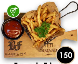
150 French Fries