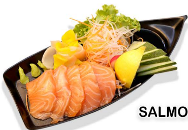
280 SALMON SASHIMI