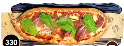
Parma Ham Pizza