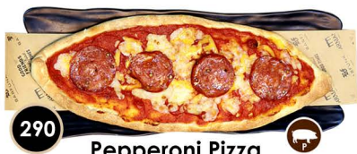
290 Pepperoni Pizza