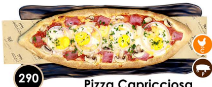
290 Pizza Capricciosa