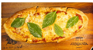
290 Margherita Pizza