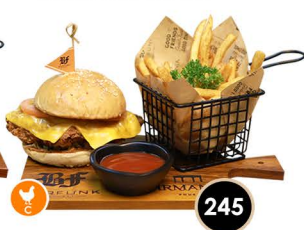
245 Chicken Burger