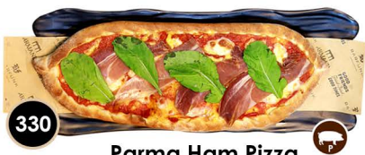
330 Parma Ham Pizza