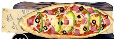
290 House Special Pizza