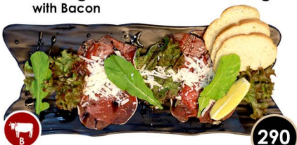
290 Beef Carpaccio