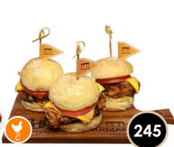
245 Chicken Slider