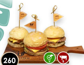
260 Beef Slider